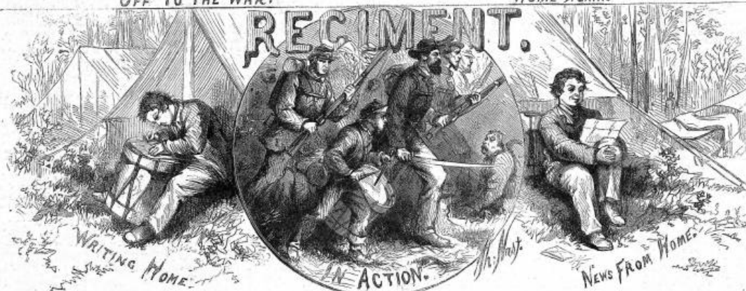
THE DRUMMER BOY OF OUR REGIMENT—EIGHT WAR SCENES.