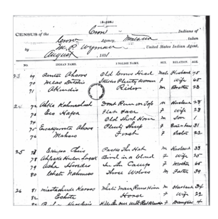
Crow Indian census roll from Montana, 1891.