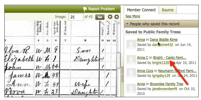
Click on the name to send a note to another researcher.

Tip: Immigrants often settled near other immigrants from their home county – sometimes even the same hometown. You can contact people researching your ancestor's neighbors from the Member Connect panel on records at Ancestry.com.